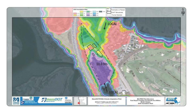
Figure 3. 2030 Coastal Flood Annual Exceedance Probabilities, Flood Entries, and Residence Times.